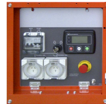
GL-6000 CONTROL PANEL

The Kubota super mini vertical diesel engines are water cooled and have increased performance for dependable horsepower and when direct coupled to the generator, provide continuous power output levels with minimum power loss.