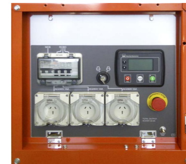
GL-9000 CONTROL PANEL